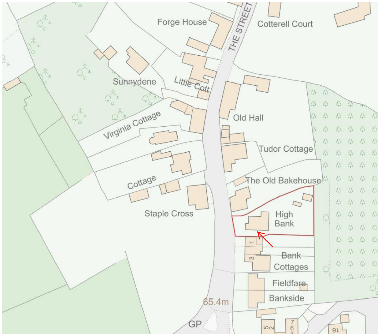
Figure 1. Map of site location at NGR 612781 151369 (Red line and red arrow-service trench)