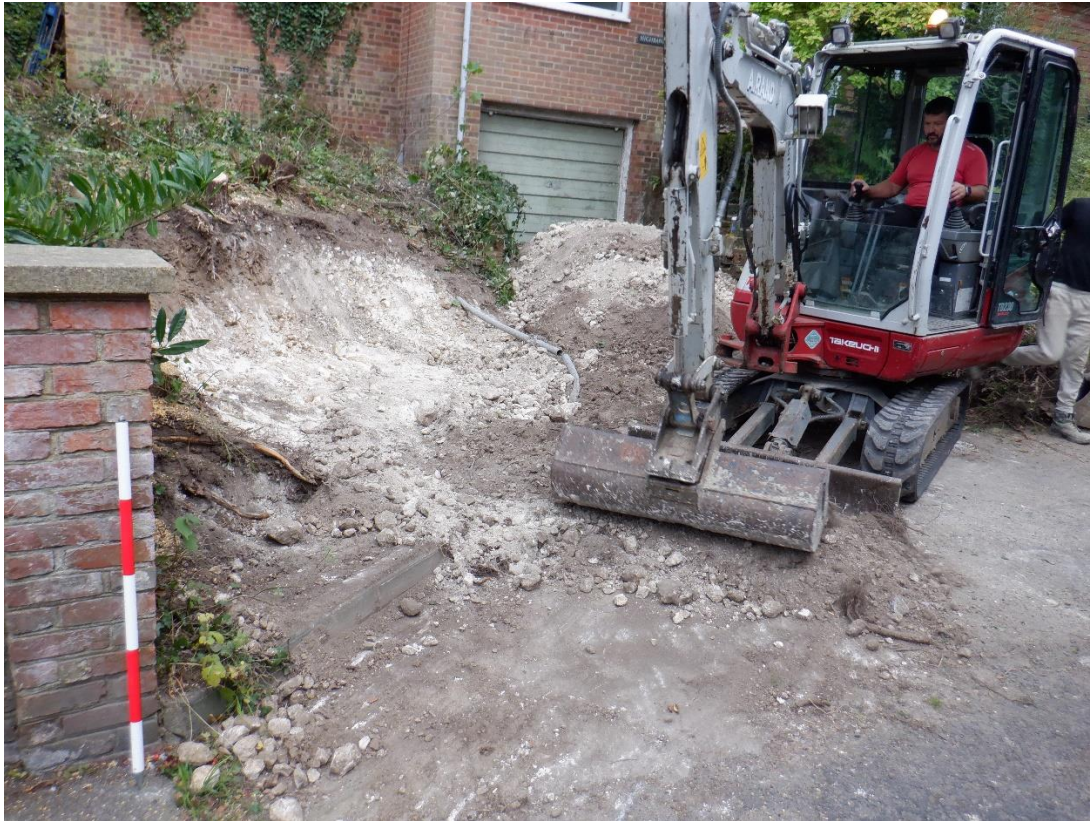
Plate 3. Excavating front garden for parking space (looking NE)