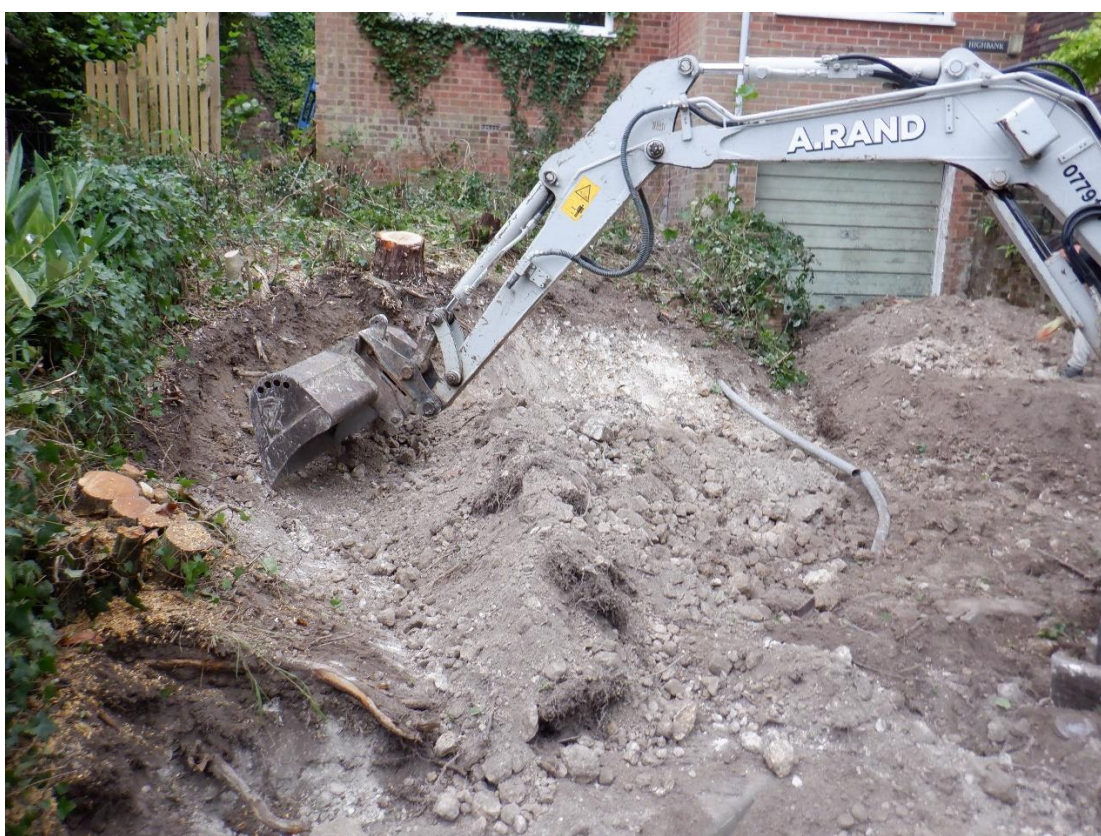
Plate 2. Excavating front garden for parking space (looking NNE)