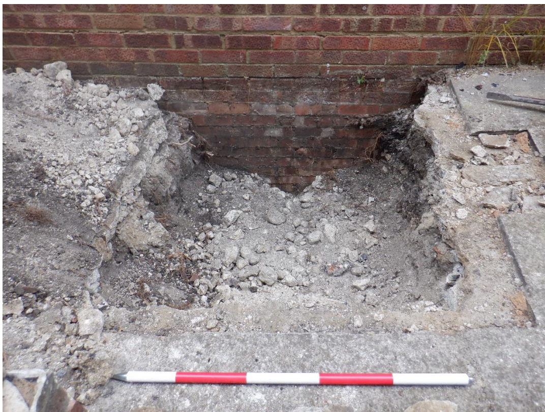
Plate 6. Service trench on south side of property