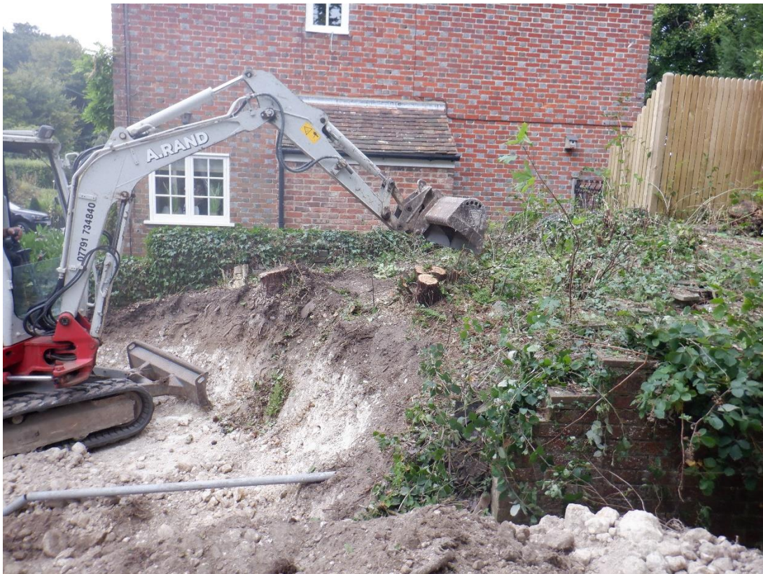
Plate 4. Excavating front garden for parking space (looking North)