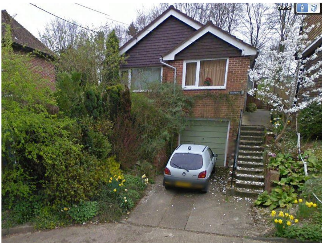
Plate 1. View of site prior to development- Google Earth (looking East)