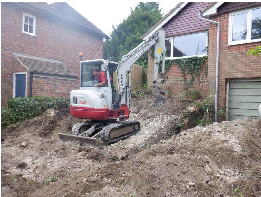
Plate 5. Excavating front garden for parking space (looking NE)